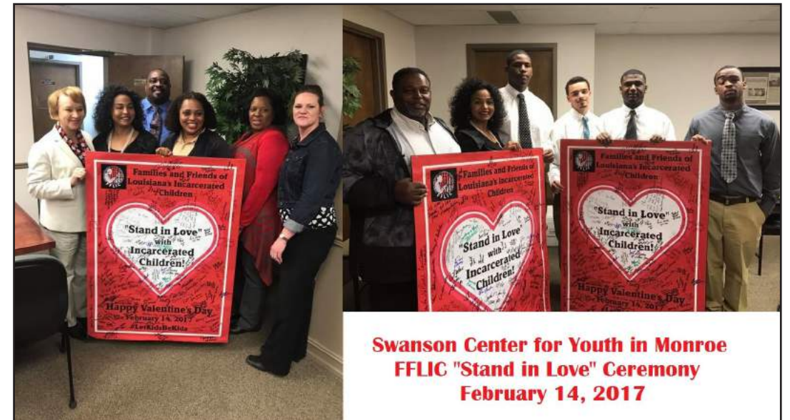
Swanson Center for Youth in Monroe FFLIC "Stand in Love" Ceremony February 14, 2017

On February 14, 2017 hosted a "Stand in Love" direct action working with statewide juvenile detention facilities to share love with incarcerated children on Valentine's Day.